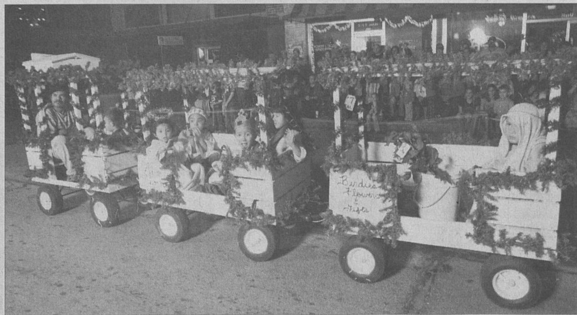
Birdie's Flowers and Gifts won the Best Commercial Category.